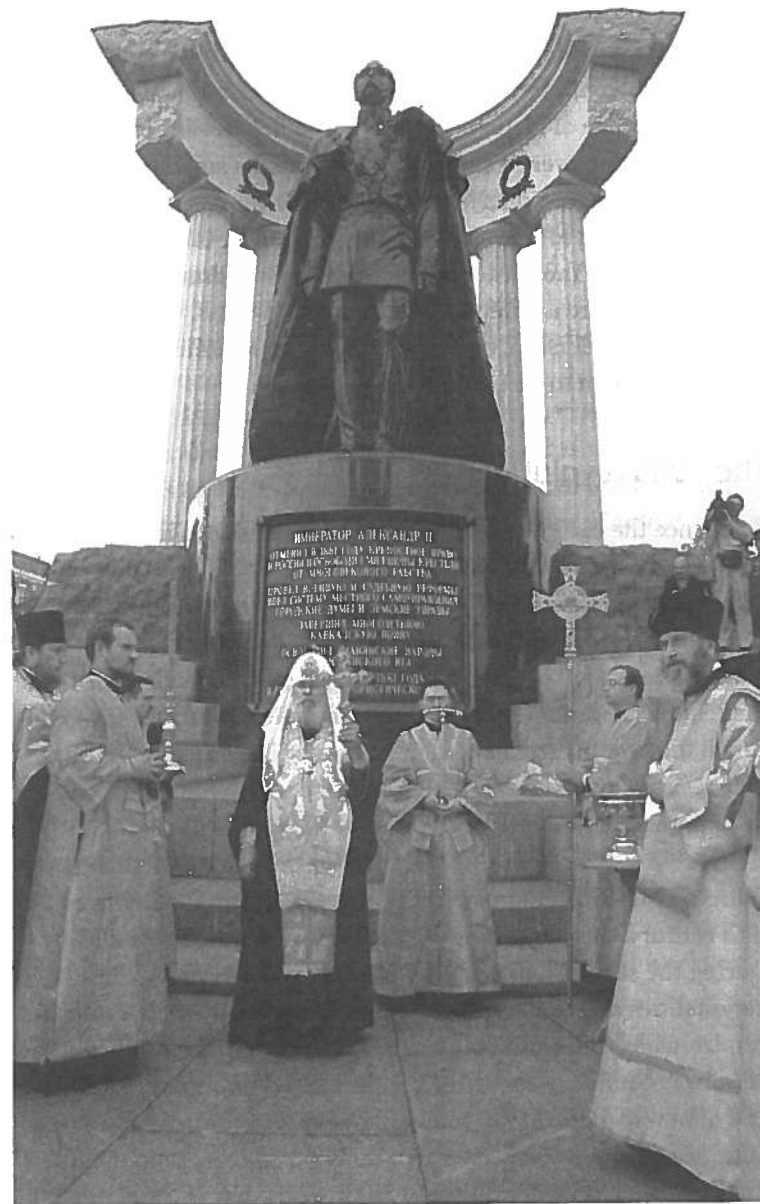
9. Patriarch Alexii sanctifies the monument to Tsar Alexander II, erected only after the fall of the Soviet Union

By now, the SRs had a rival, in the form of a socialist party which was not interested in the peasant community, but proclaimed that Russia's revolutionary future lay in the hands of the urban working class. Inspired by the theories of Marx, the Social Democrats (SDs) asserted that capitalism, as it came from Europe